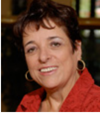
National PTA President