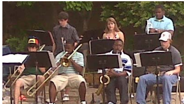
C. E. Byrd High School Jazz Band performed at the Maggie Lee Henson Celebration of Caring