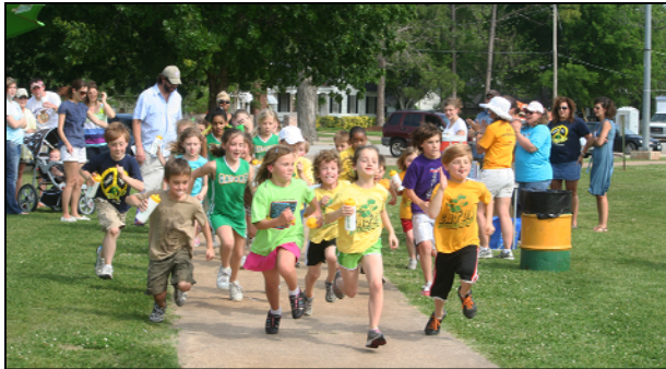
A.C. Steere students blast off the starting line during the Picnic in the Park Run-A-Thon that raised more than $1,000 for the school.

Activities started with a rugby match between Shreveport and Austin, followed by a run-a-thon that raised more than $1,000 for the school. Among the tents, picnic blankets and grills scattered across A.C. Steere Park were a kickball game and photos with A.C. Steere's famous Watch DOGS, a hula-hoop contest, concerts by ACS vocalists and string musicians, and concessions. An outdoor movie capped off a perfect afternoon of fun for A.C. Steere and neighborhood families.