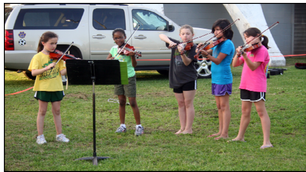
A.C. Steere string musicians perform for families April 9 at the first annual LEAP Week Kick-Off Picnic in the Park.

First Lady Michelle Obama and Dr. Jill Biden recently announced the launch of "Joining Forces." Joining Forces is a comprehensive national initiative to mobilize all sectors of society to give our service members and their families the opportunities and support they have earned. In response to Joining Forces, National PTA and the Military Child Education Coalition (MCEC) recently announced a partnership to engage military families and support the more than 1 million grade-school children with one or more parents in the armed forces. The partnership will work to build connections between military and civilian parents and students through programs and activities in school districts with a large military presence. The two organizations will also work together to educate state PTA leaders on education issues that affect military children and communicate the role that they can play in supporting these families. For more information about this partnership, visit pwrnewmedia.com/2011/national_pta/mcec/ .